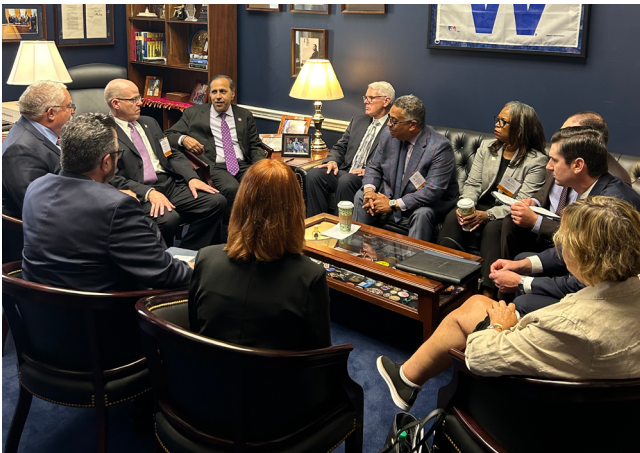
TOI delegation meeting with Rep. Raja Krishnamoorthi (D-IL-8).